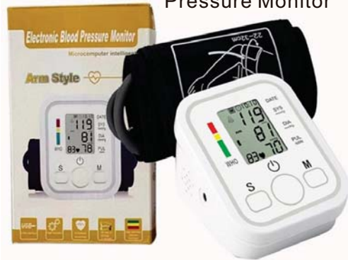
B01 Blood Pressure Monitor