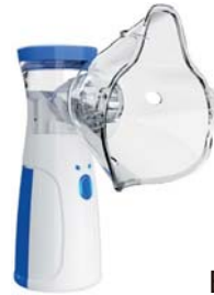
W302 Mesh Nebulizer