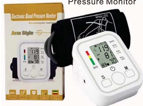
B01 Blood Pressure Monitor